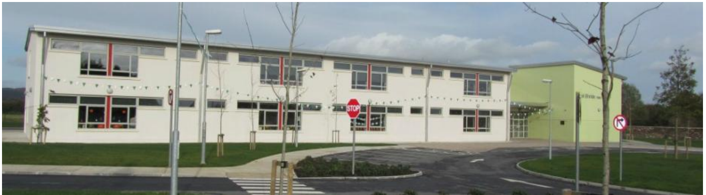
8 classroom school building (including Hall) recently completed in Cork.

Two new purpose built temporary classrooms will be constructed in time for September to cater for our additional pupils.